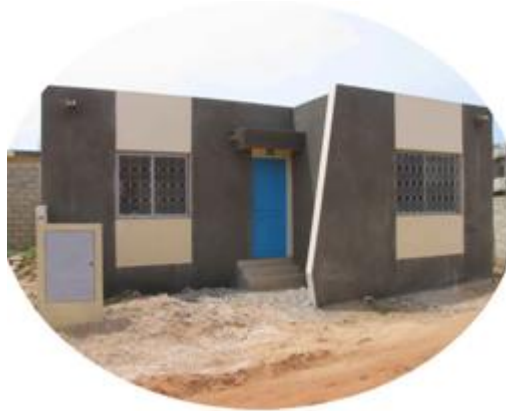
Image B1: Housing Project, Keur Massar

Picture of future housing project Keur Massar. Found at http://www.sicap.sn/futurprojet.php on April 29, 2014 all photo credit to the "Société immobilière du Cap-Vert" This image is used to represent unreleased flier found in SICAP office on March 23, 2014. I was unable to take a picture of this flier in my own personal camera because of disclosure issues. Fortunately, I was able to find a similar picture on the SICAP website. This modernized dwelling is similar to the housing styles of other SICAP housing projects such as SICAP Sacre-Coeur and SICAP Libertie.