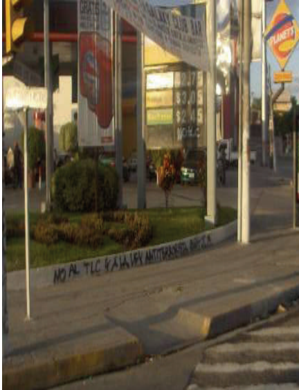
Sidewalk graffiti protests CAFTA and El Salvador's controversial new anti-terrorism law.

El Salvador is a country plagued by a turbulent and violent history. Coming out of the civil war, in 1992 the Peace Accords offered new hope for the war-torn country. The government set about improving the economy utilizing free-market initiatives such as the privatization of the banking system, telecommunications, public pensions, electrical distribution, and some generation of electricity as well. A reduction of import duties also was initiated to spur international trade. A solid growth of GDP since the 90's has been a result of these initiatives. Yet the population of El Salvador suffers from a severe inequality in the distribution of wealth. Many of the jobs