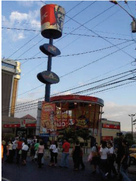
Romero anniversary marchers in downtown San Salvador file past an enormous KFC.