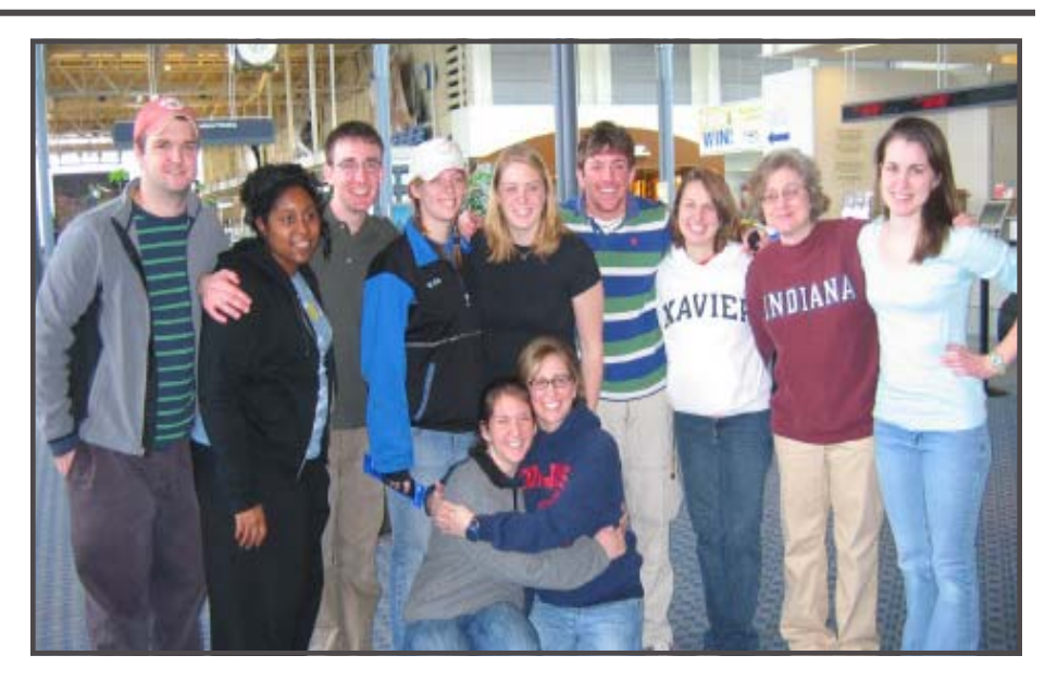
Group just before departure from the Cincinnati airport, January 29, 2007