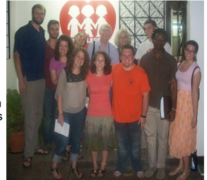
The group posing with Fernando Cardenal at his office in the Fe y Alegria center.