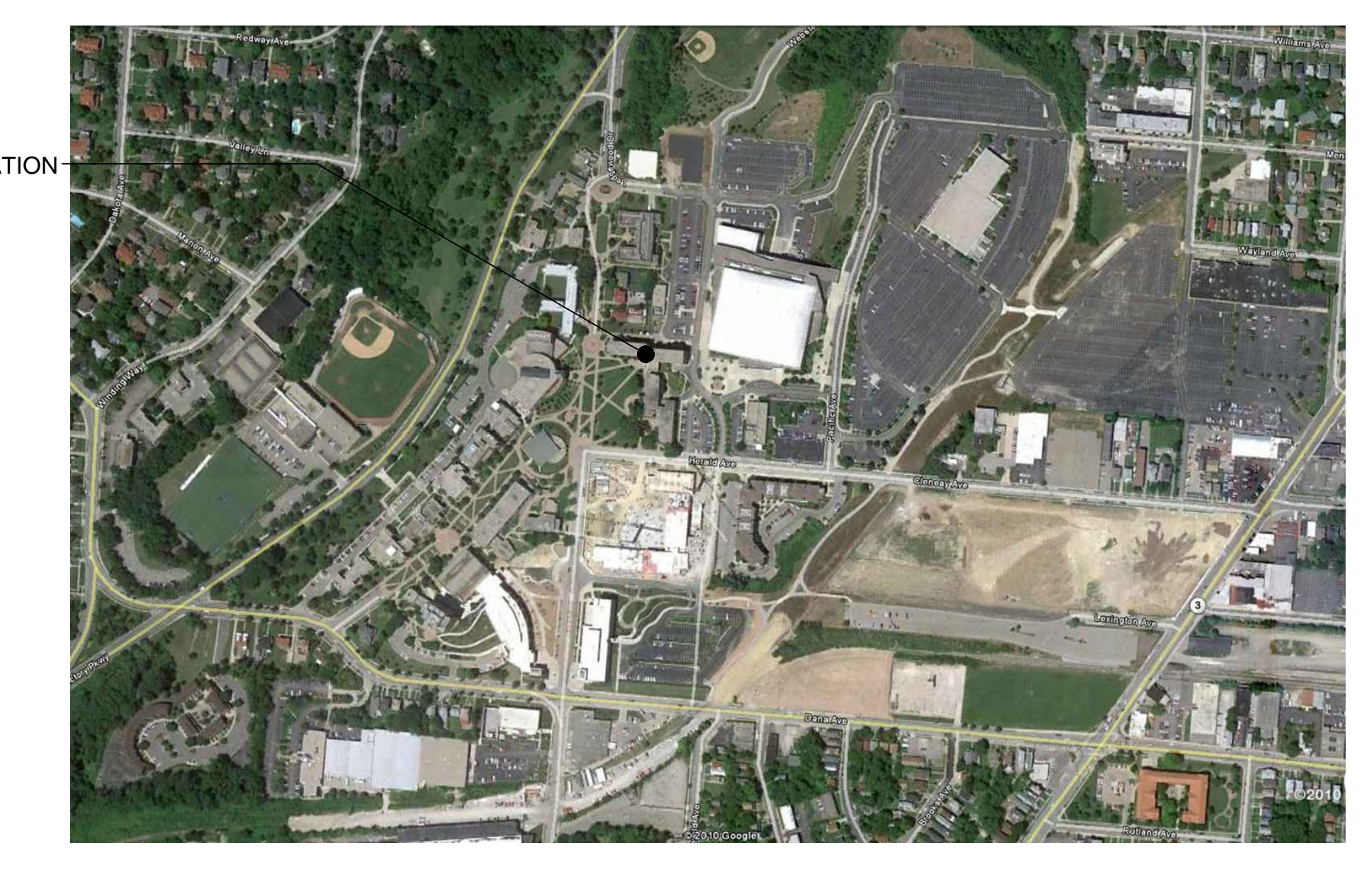
XAVIER UNIVERSITY CAMPUS