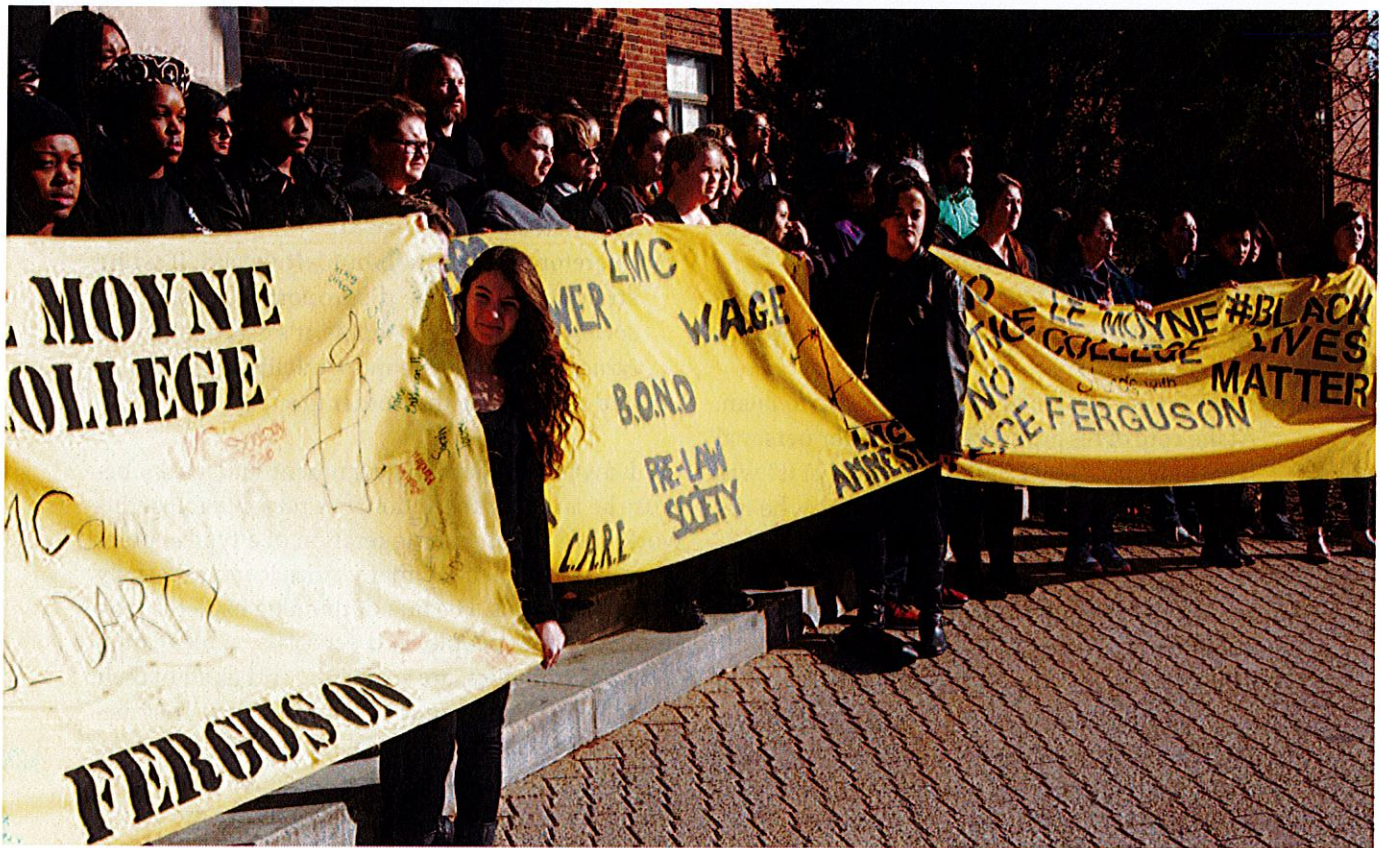
In May 2015, approximately 50 students, faculty, and administrators gathered outside of Grewen Hall, Le Moyne College, to express their solidarity in support of the people of Ferguson. Following a moment of silence, the group walked throughout the main academic complex before reconvening outside for prayer and reflection.

Such thinking explains in great measure the apathy or indifference of white Christians toward police violence and misconduct in our society, especially as these are experienced by communities of color and protested by the Movements for Black Lives. A recent Public Religion Research Institute report related how over 80 percent of black Christians believe that police-involved killings of black people are part of a much larger picture of racial injustice. However, an almost equal number of white Christians believe the opposite, holding that such deaths are mainly isolated incidents with no connection to one another. (Seventy-one percent of Catholics hold this view.) Indeed, white non-Christians are more likely to see a systemic problem than white Christians.