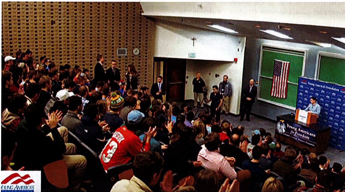
Ben Shapiro speaks to students in a packed lecture hall at Marquette University.

Let us consider a concrete example of how this insistence upon the demise of systemic racism and assumption of personal responsibility plays out.