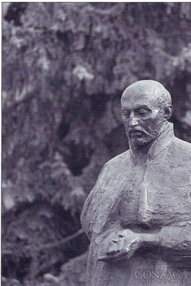
Statue of Saint Ignatius, Gonzaga University.

Instead of finding all our faults and sins, we find the movements of God.