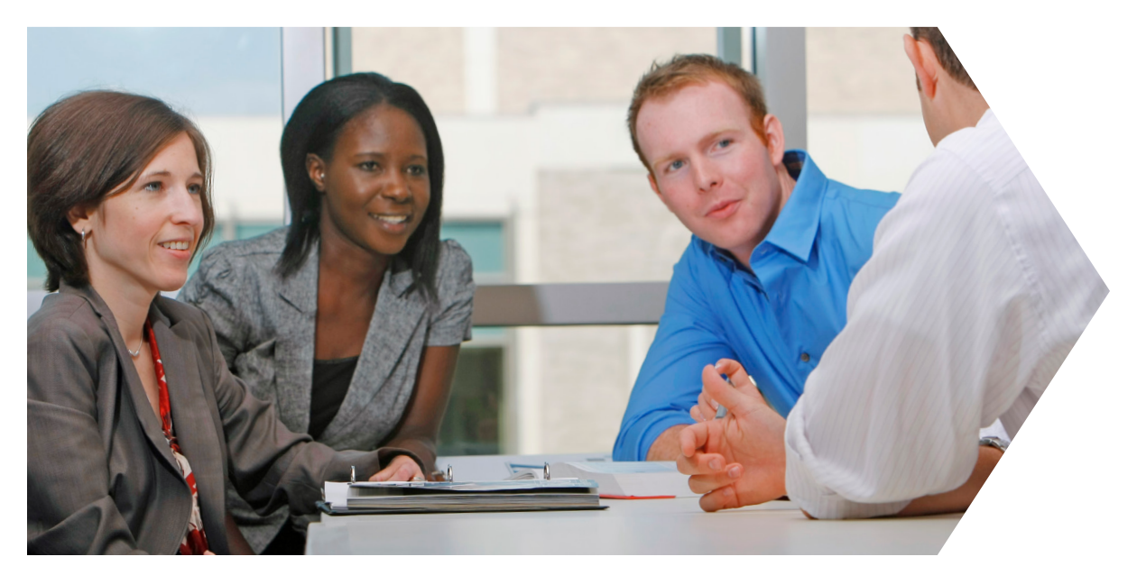
OBJECTIVE 4.2. Provide opportunities for faculty and staff to advance their cultural proficiency with respect to intercultural and race-related competencies (e.g., awareness, communication, engagement) and exposure to inclusive pedagogical models that will enhance the learning of all students.

STRATEGY 7. Work with faculty and committees to monitor the impact of the diversity-related education and co-curricular experiences and respond to the findings through the appropriate faculty and staff committees.