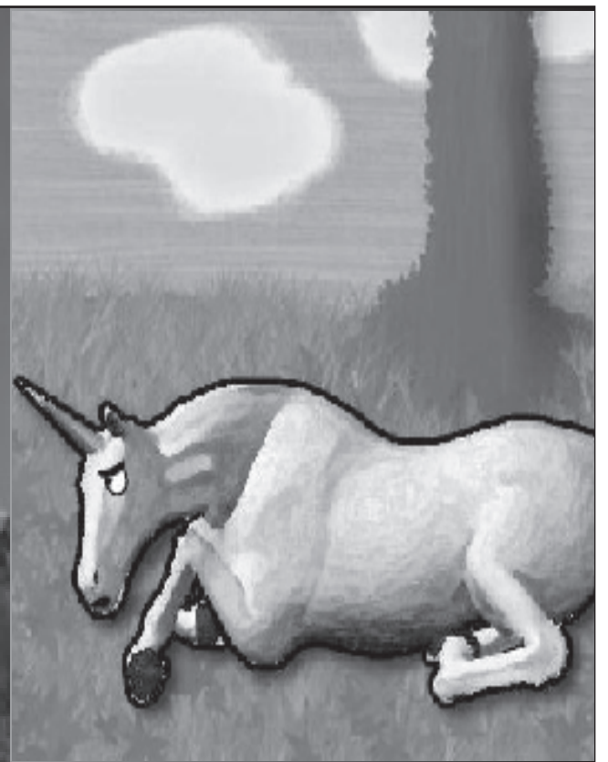
Dan Radcliffe and Charlie the unicorn...future co-stars?