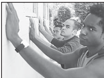
The controversial "N*W*C" plays at GSC on Saturday. The show has been banned from other colleges.