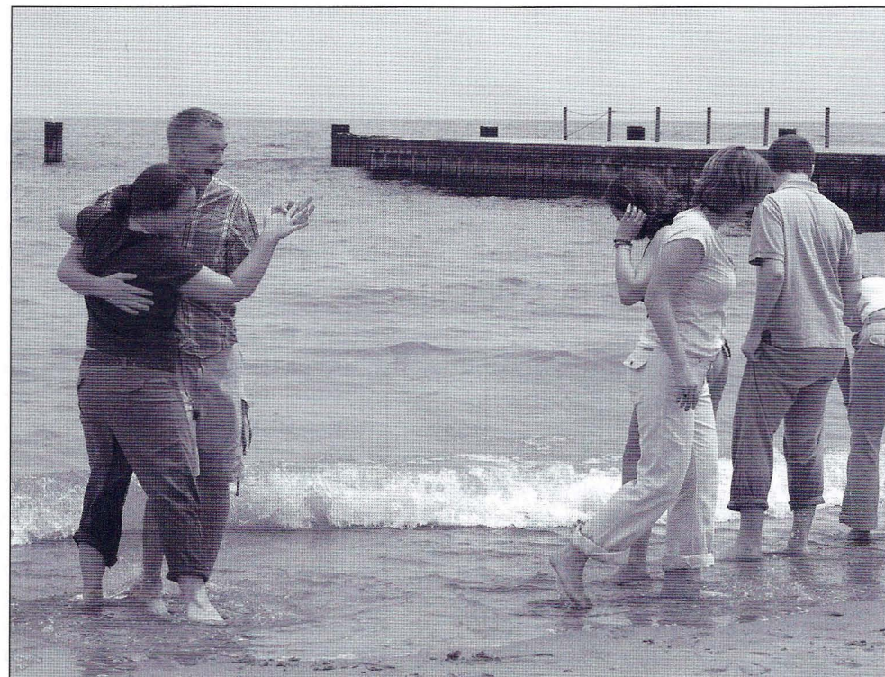
Students from the Loyola University of Chicago enjoy time together at the beach.

On the topic of setting boundaries and abstinence: many students see the idea that they can set boundaries with regard to sex and their