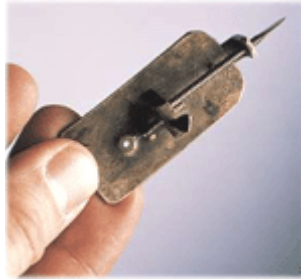
Figure 2: Leeuwenhoek’s microscope. A simple device that contains a magnifying glass with screws for manipulating the specimen. The lens is convex on both sides and is about the size of a pinhead. The object being viewed was mounted on a specimen holder or inside a glass tube, which was mounted on the specimen holder. 58

microbial world. He used his instruments to make observations of these unknown creatures, which he called “little animals”. 57