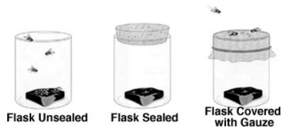
Figure 1: Depiction of Redi's experiment: when the flask remained unsealed maggots covered the meat within a few days. When the flask was sealed no maggots appeared on the meat. When the flask was covered with gauze, maggots appeared on the gauze but not on the meat. 56

This experiment allowed for a new insight on experimentation and showed that what appears to be true through one method is not always the truth. Redi got much prestige with this experiment and changed many minds in the scientific community about whether or not spontaneous generation can happen. Redi conducted experiments on various different insects including scorpions, bees and wasps, but no other experiment gained more esteem than the one concerning the appearance of maggots.