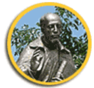
Ignatius of Loyola

T he School for Adult Catholic Religious Education (SACRE) is an XUCCE-sponsored program that offers workshops for teachers, catechists, and interested adults. The four-session workshops will include the topics of Christology, sacraments, church, Scripture, morality, church history, and other religions. SACRE workshops can be used for diocesan certification and are affordable ($60). The next workshop, The Church and Ministry , will be held on October 16, 23, 30, and November 6, 7-9:30 pm. Contact XUCCE for details.